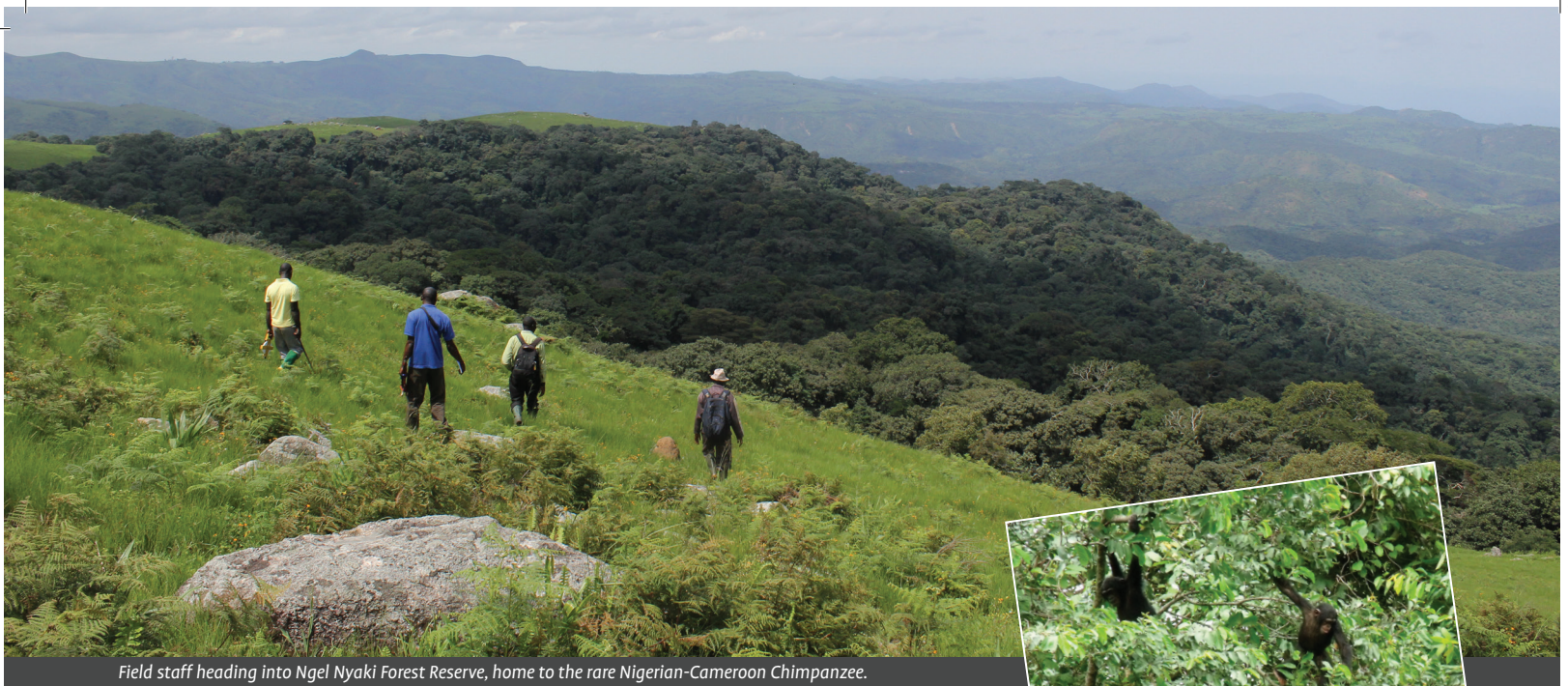
Field staff heading into Ngel Nyaki Forest Reserve, home to the rare Nigerian-Cameroon Chimpanzee.