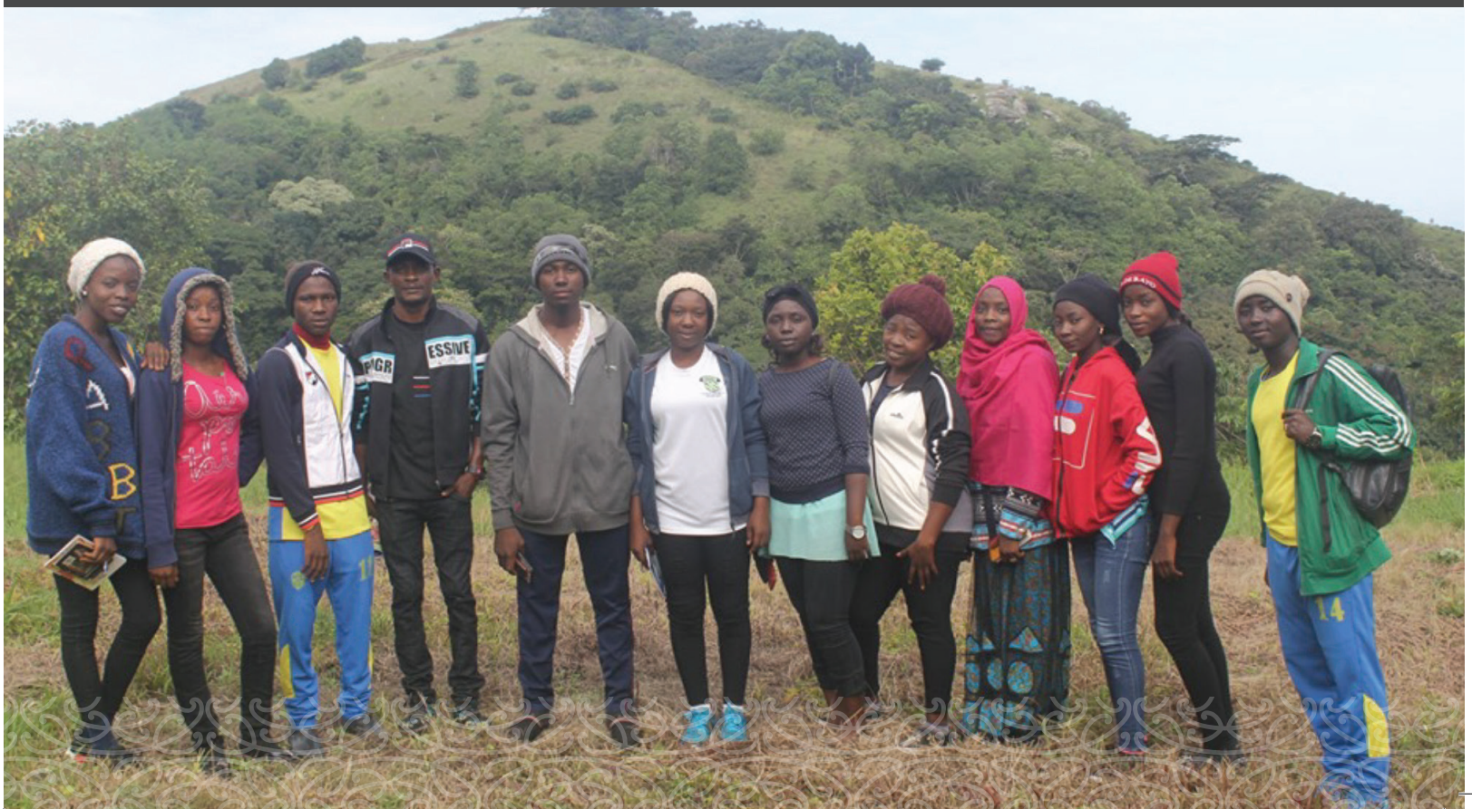
Undergraduate Industrial Training (IT) students undertaking their six month placement at the research station in 2017.